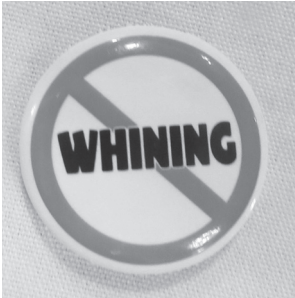
No Whining - Motto One precentor